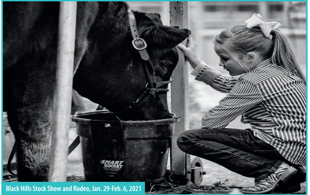
Black Hills Stock Show and Rodeo, Jan. 29-Feb. 6, 2021

Dakota Ridgetop Toy Show, Codington County Extension Complex, Watertown, SD 712-261-0316