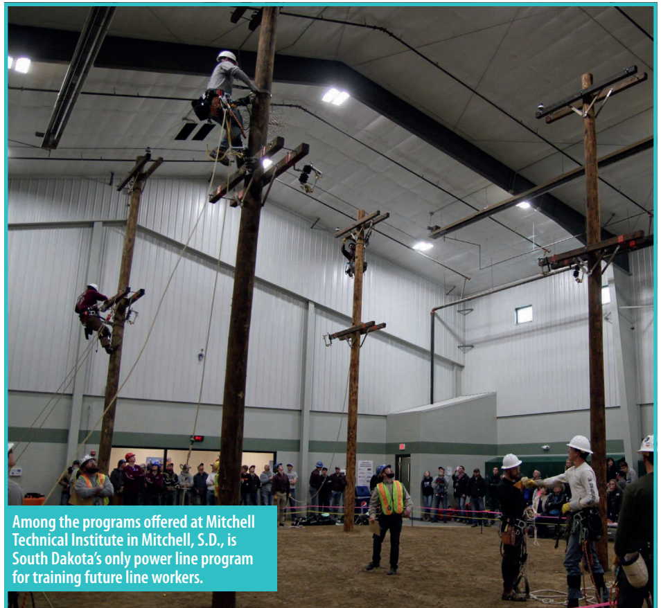
Among the programs offered at Mitchell Technical Institute in Mitchell, S.D., is South Dakota's only power line program for training future line workers.

Western Dakota Tech is the only technical college serving the western half of the state. It notes that 96 percent of its most recent graduates are working, continuing their education or enlisting in the military.