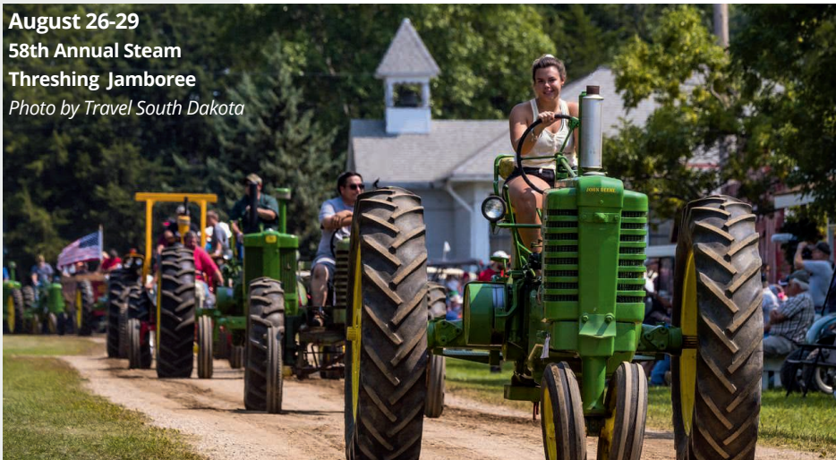
August 26-29 58th Annual Steam Threshing Jamboree

To have your event listed on this page, send complete information, including date, event, place and contact to your local electric cooperative. Include your name, address and daytime telephone number. Information must be submitted at least eight weeks prior to your event. Please call ahead to confirm date, time and location of event.