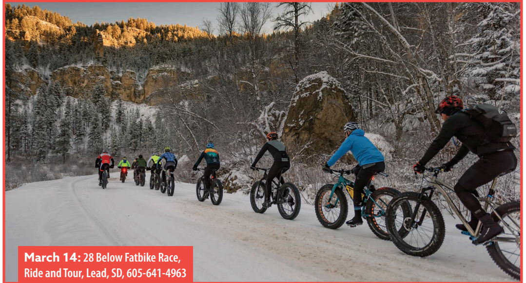
March 14: 28 Below Fatbike Race, Ride and Tour, Lead, SD, 605-641-4963