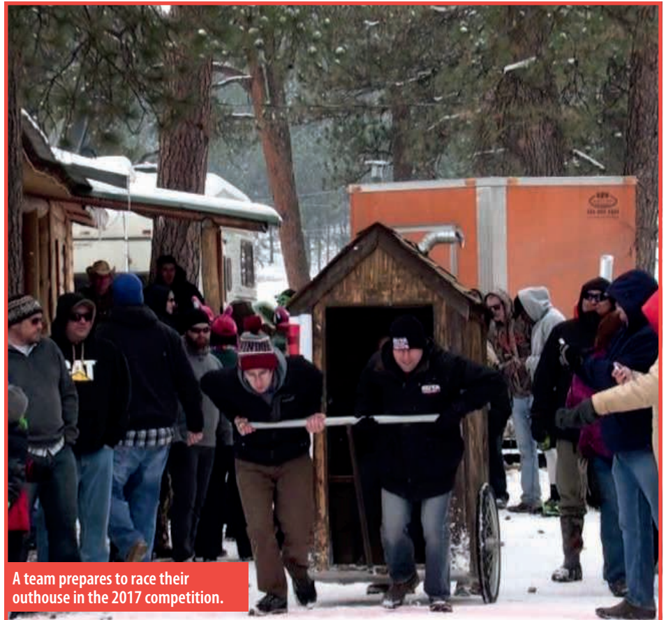
A team prepares to race their outhouse in the 2017 competition.

Money raised at the event helps Shriners cover the transportation expenses of some 630 children in western South Dakota who seek care at Shriners Hospitals