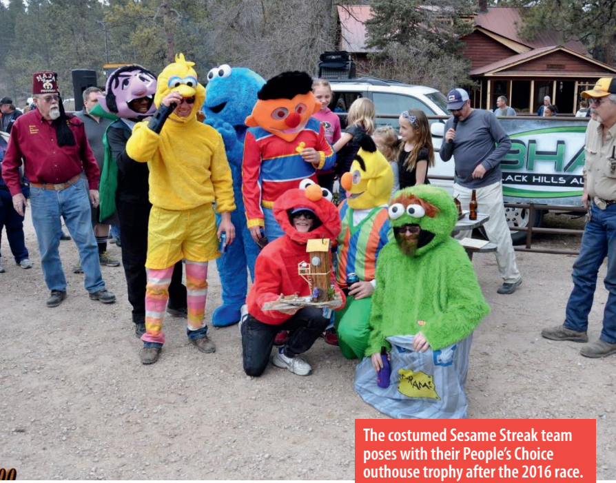
The costumed Sesame Streak team poses with their People's Choice outhouse trophy after the 2016 race.

Teams make a mandatory pit stop at mid race for a fire-drill. Each member must run around the outhouse three times and the rider must switch places with one of the pushers. Each team member will be required to place a color-coded roll of toilet paper on a color-coded plunger in order of color scheme provided at race time. The race will be timed from start to finish, the objective is to get the lowest time to win.