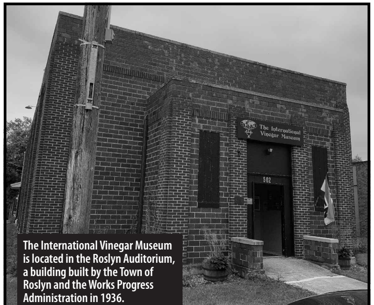
The International Vinegar Museum is located in the Roslyn Auditorium, a building built by the Town of Roslyn and the Works Progress Administration in 1936.