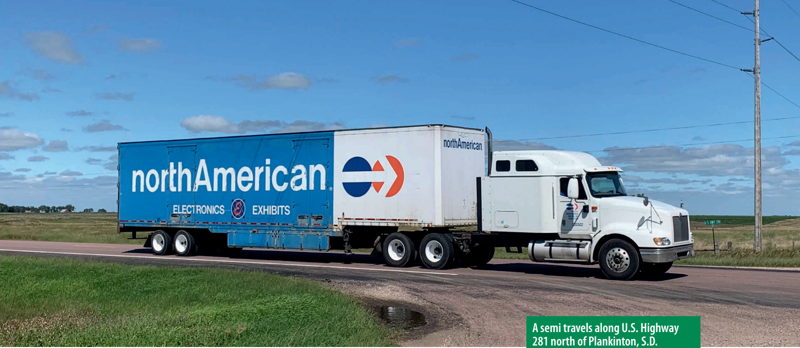
A semi travels along U.S. Highway 281 north of Plankinton, S.D.

46 years old, and almost as alarming is that the average age of a new driver being trained is 35 years old.