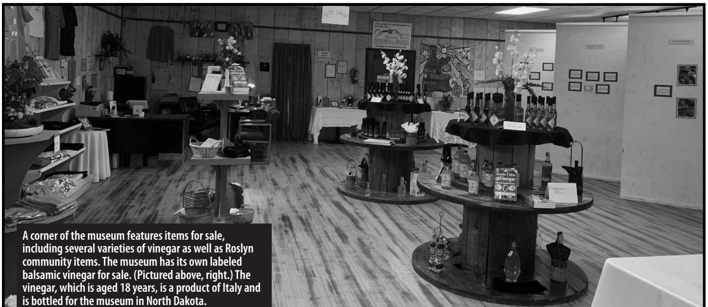
A corner of the museum features items for sale, including several varieties of vinegar as well as Roslyn community items. The museum has its own labeled balsamic vinegar for sale. (Pictured above, right.) The vinegar, which is aged 18 years, is a product of Italy and is bottled for the museum in North Dakota.