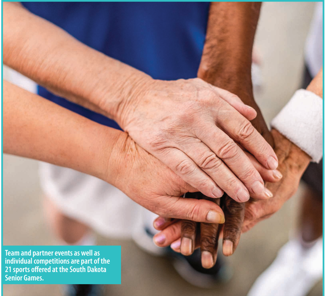
Team and partner events as well as individual competitions are part of the 21 sports offered at the South Dakota Senior Games.

By 1996, state funding for the games was withdrawn, but the games continued on. A Senior Games board of directors was formed, comprised of participants from across the state. The non-profit establishes the rules and regulations for the games and provides financing and developing local, regional games as well as the state games which features 21 different sports.