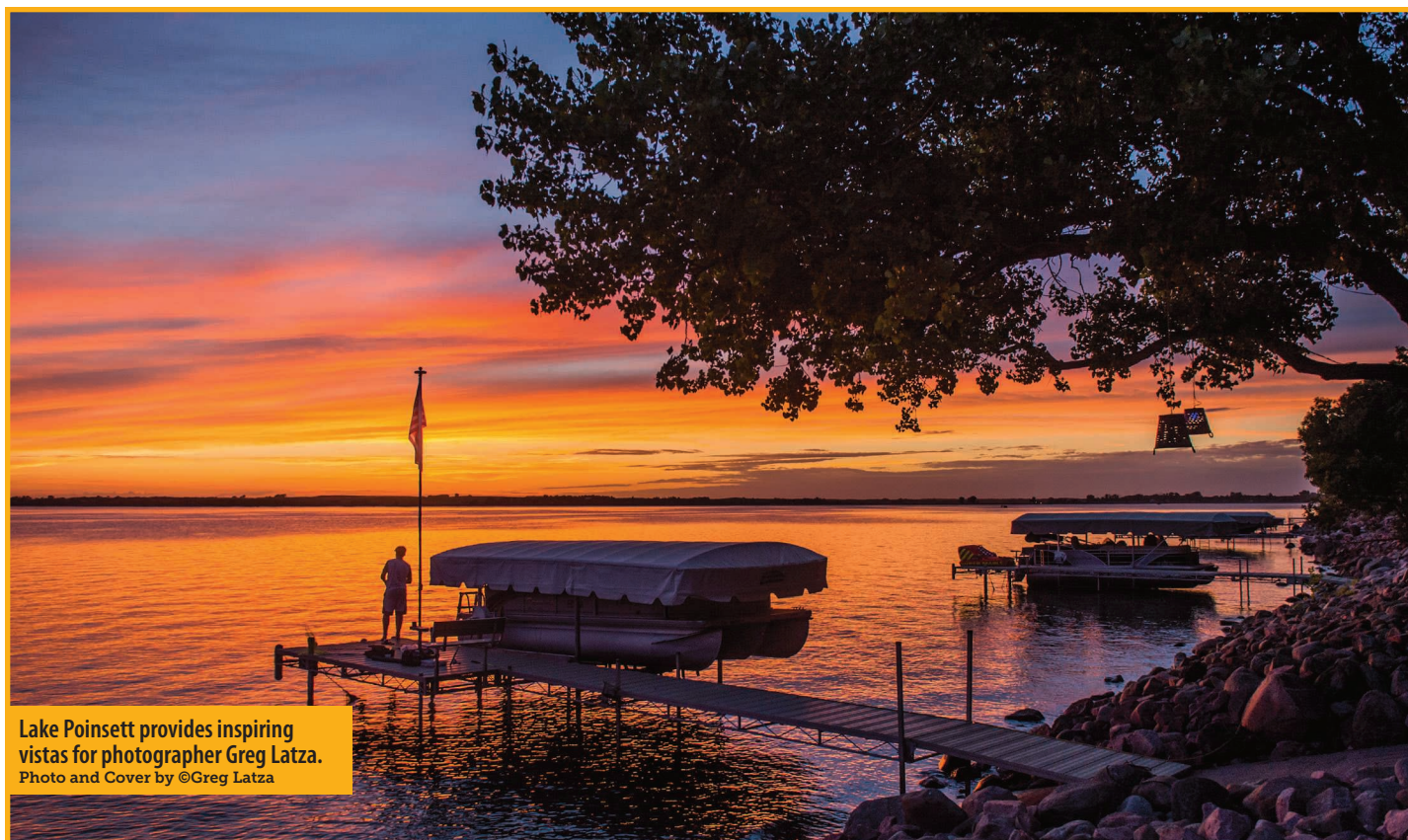
Lake Poinsett provides inspiring vistas for photographer Greg Latza.

“Even with the challenges, the real growth we have is along the reservoir,” said Keller.