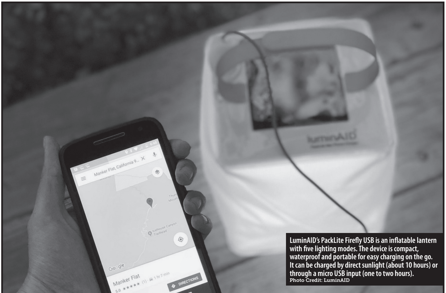
LuminAID's PackLite Firefly USB is an inflatable lantern with five lighting modes. The device is compact, waterproof and portable for easy charging on the go. It can be charged by direct sunlight (about 10 hours) or through a micro USB input (one to two hours).